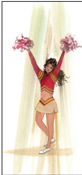
Go Cyclones! $70