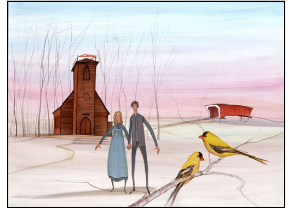
Land That I Love $70