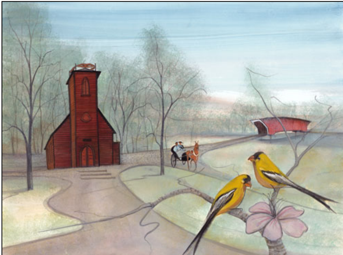
For the Love of Iowa

View the Iowa Convention Brochure in PDF Format or eCatalog Format