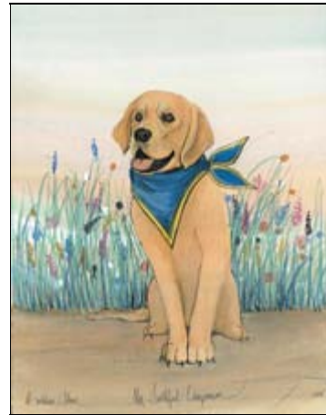
My Faithful Companion A fundraising print for Canine Companions for Independence

Print editions may retail from $80 per print to $200 or more.