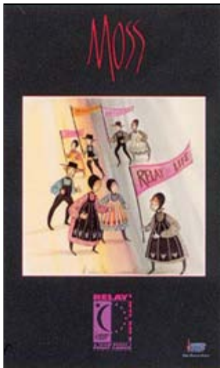
Relay for Life Poster

P. Buckley Moss charitable print editions are usually limited to 500 or 1,000 prints – more for larger organizations.