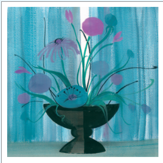
CANOPY OF BLUE Giclée on Canvas IS: 10 x 10 ins. $200 IS: 20 x 20 ins. $600 IS: 40 x 40 ins. $3,000