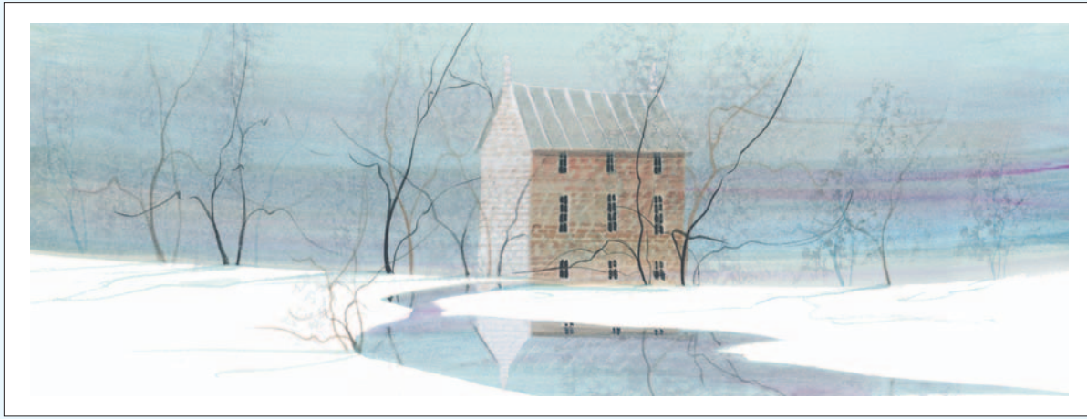
ALL IS CALM Giclée on paper IS: 4-3/4 x 13-3/16 ins.