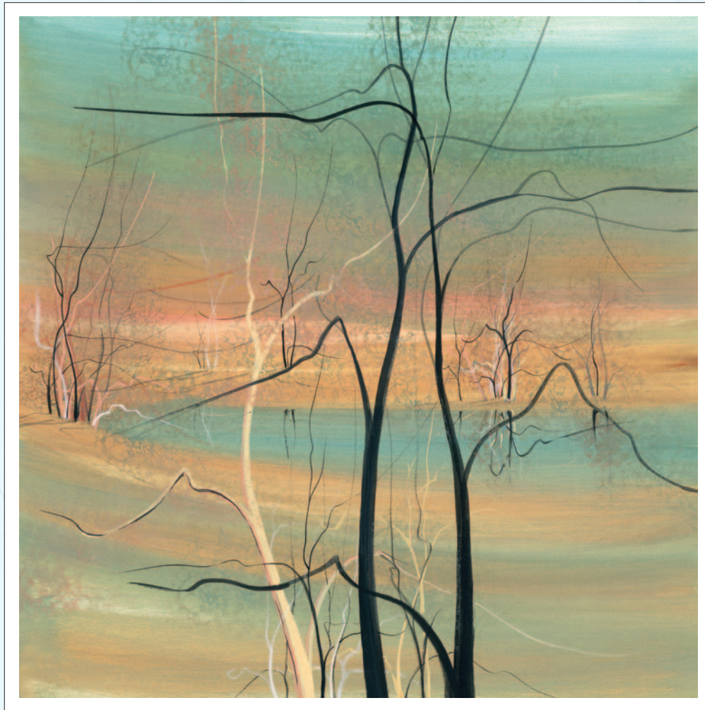
TREES AT TWILIGHT Giclée on Canvas IS: 10 x 10 ins. IS: 20 x 20 ins. IS: 40 x 40 ins.