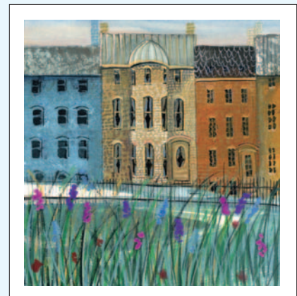
ROW HOUSES IN SPRING Giclée on Paper IS: 6-1/4 x 5-7/8 ins.