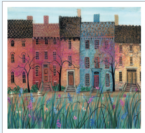
GRACED BY SPRING Giclée on Paper IS: 8-7/16 x 9-3/16 ins.