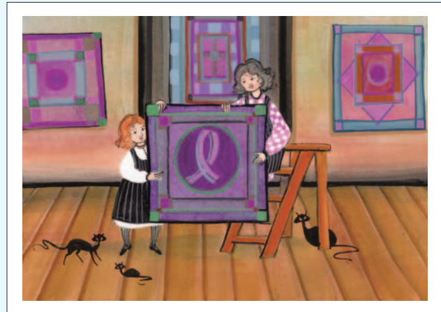
QUILTING FOR A CURE Giclée on Paper IS: 4-13/16 x 6-5/8 ins.