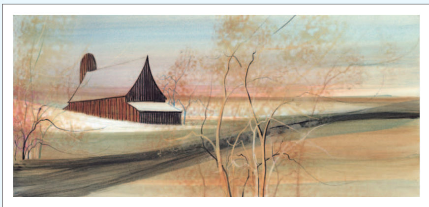
A TIME TO HARVEST Giclée on Paper IS: 6-5/16 x 13-7/8 ins.