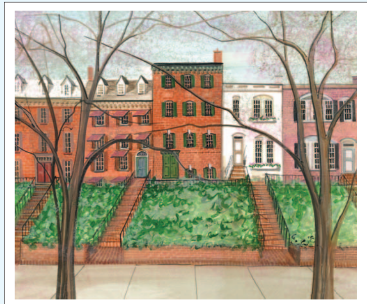
GEORGETOWN ROW HOUSES Giclée on Canvas IS: 12 x 14 ins.