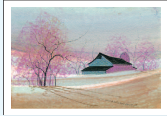
RED BUD IN BLOOM Giclée on Paper IS: 3-7/8 x 5-11/16 ins.