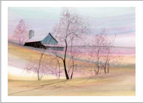
AS NIGHT FALLS Giclée on Paper IS: 5-1/8 x 7-3/8 ins.